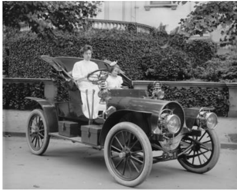
Figure 1: 1907 Franklin Model D roadster. Photograph by Harris & Ewing, Inc. [Public domain], via Wikimedia Commons. ( https://goo.gl/VLCRBB )